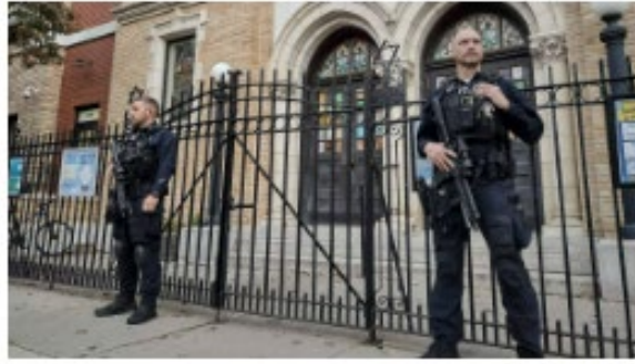
Police officers stand watch outside the United Synagogue of Hoboken, New Jersey, on Thursday.